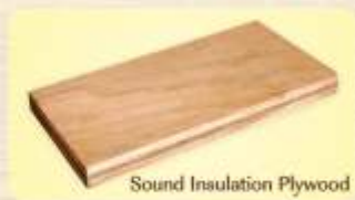
Sound Insulation Plywood

has come up with the special product called marine sound insulation plywood which is fully capable to fight noise pollution. This ready to used plywood is manufactured by sandwiching a layer of sound absorbing material between two plywood sheets. It has the capacity to reduce the noise upto 25 Db. It is light in weight, fire retardant and has high strength to weight ration. It is easy to work with using conventional wood working tools and can be drilled, milled, trusted and swan to close tolerances.