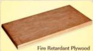
Fire Retardant Plywood

Applications : This plywood has very high fire retardant properties and is heavily used in Hotels, Defence, Navy and other high profile buildings.